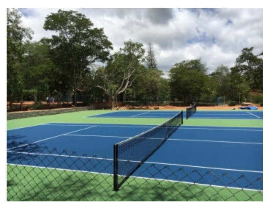
The new Tennis count