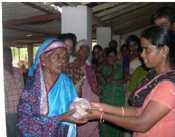
1The first of the millet kanji mix